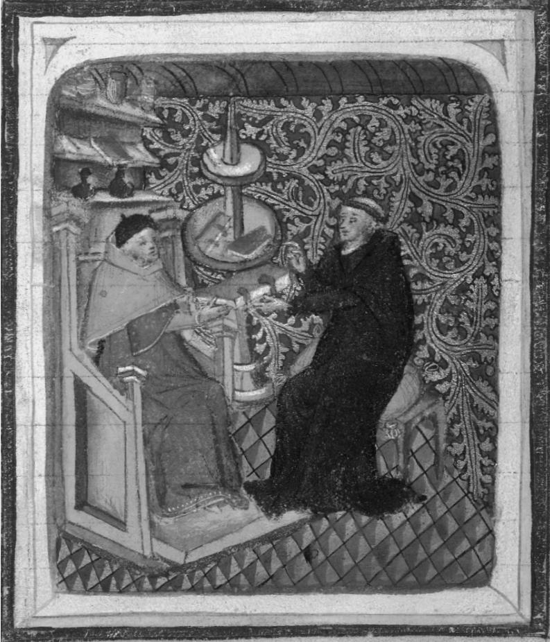
Fig. 4. The presentation scene of John Lydgate's Fall of Princes .